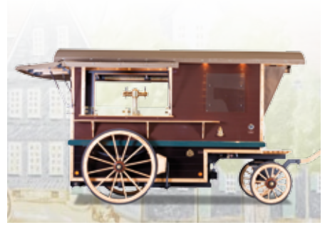
■ Cocktail Waggon