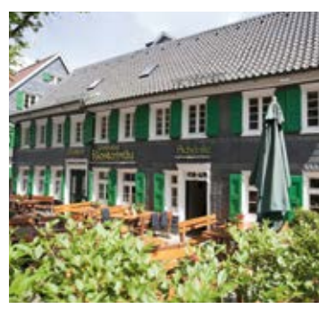
Gräfrather Klosterbräu Brewery