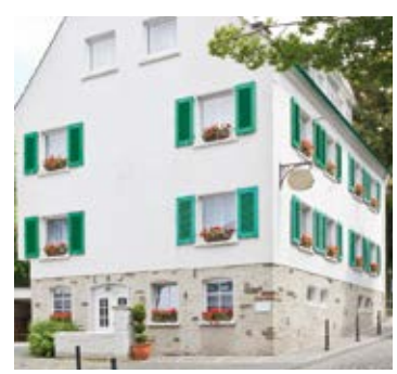
"Alte Schule" Guesthouse