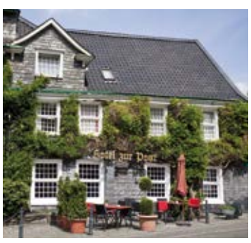
Hotel zur Post