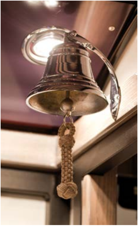
HOTEL Gräfrather & bot