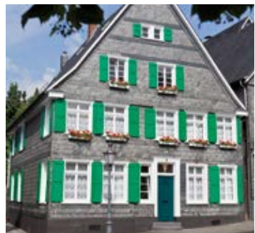
Gästehaus am Markt