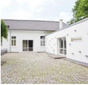
■ Hall "Kloster-Saal"