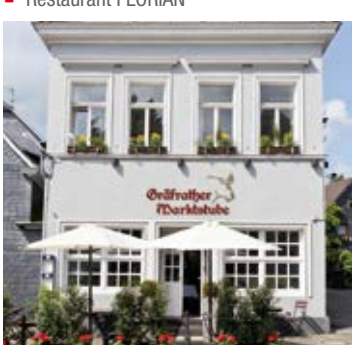
New steak house on the market square