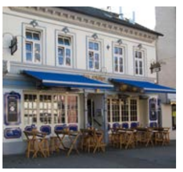
Alt Ohligs Brewery